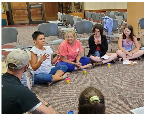
Orientation Worship Service, Fall 2019

PCM is intended to be a safe place for all people to be in relationship with the Lord. I hope that God uses my continued desire to seek Him, my past, and my present to continue that intent and to bring scriptural understanding, spiritual prayer, and loving fellowship.